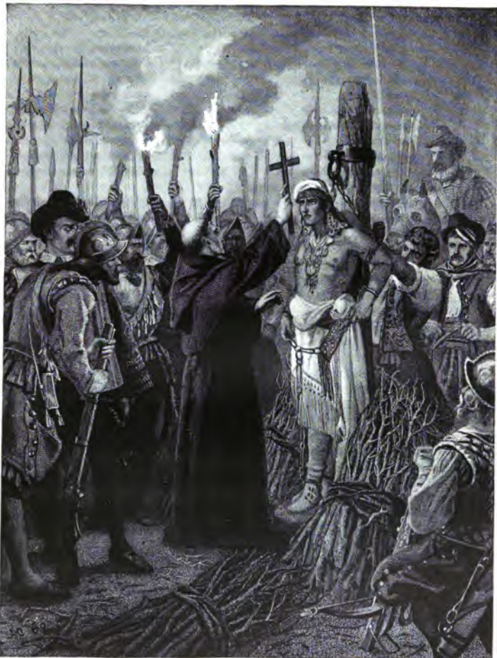
EXECUTION OF THE INCA OF PERU